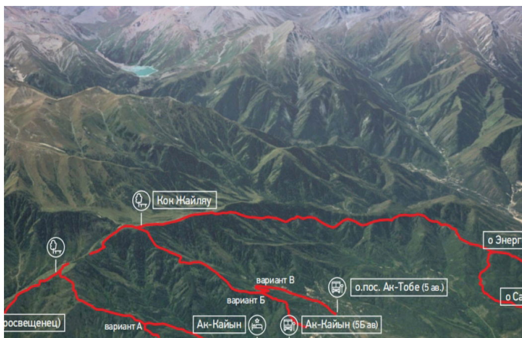
Figure 1 – Map of the Kokzhailau Gorge of the Ile Alatau

ture Park, situated between the Small and Big Almaty Gorges, approximately 10 km from the city of Almaty, Kazakhstan. The elevation of the area is 2200 m above sea level (a.s.l.) [2].