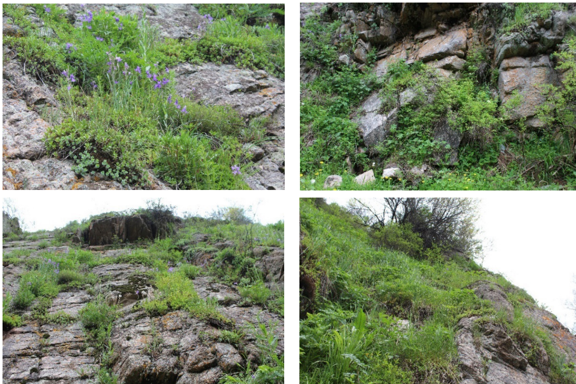
Figure 2 – Populations of P. hybridus and H. ewersii identified in the Ile Alatau, Big Almaty Gorge, and Kok-Zhailau tract

cal habitats of P. hybridus and H. ewersii in these areas are characterized by stony and rubble soils, rock crevices, and the middle forest belt (Fig. 2).